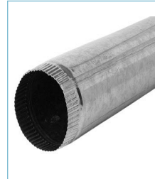
CONDUCTOR & SNAPLOCK PIPE